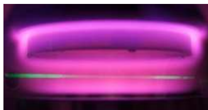
Figure 1: Photo of a N_2 - CH_4 plasma in the PAMPRE setup; the green line is due to the light scattering of a laser beam at 532 nm by the aerosols in suspension.

RF-CCP reactors (Radio-Frequency Capacitively Coupled Plasma) are well-known for initiating the creation of solid particles [5] in a reactive gas mixture. These aerosols are electrically charged and can thus grow in levitation in the plasma (see Fig.1). They remain in suspension in the plasma, i.e. with no interaction with the reactor wall, until the electrostatic force, responsible for the levitation is no longer stronger than other forces, (particle weight, neutral and ion drag forces), at which point the solid aerosols are ejected out of the plasma.