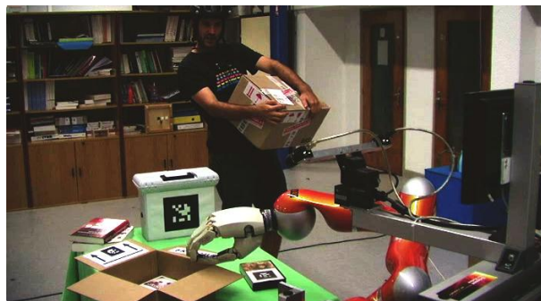
Fig. 1. Interacting with the robot in an everyday setup: the human asks for help in vague terms, the robot takes into account the human’s spatial perspective to refine its understanding of the question.

Working in a situated context, we want furthermore to resolve these semantics atoms, i.e. ground them in the sensory-