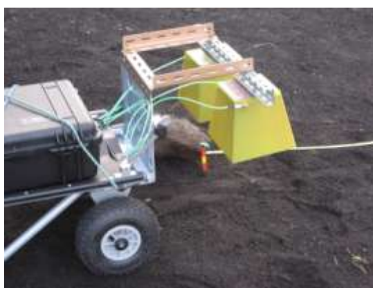
Figure 1 : Experimental set-up for field tests. The electronic unit and the batteries are in the black box. The transmitting and receiving yellow antennas are identical[2]

A WISDOM prototype, representative of the final flight model is now being tested. A series of calibrations and verifications on artificial targets have been initiated as well as field tests in a variety of natural environments.