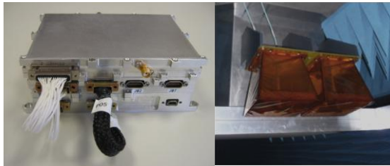
Fig. 2: Electronic Unit (left) and antenna system mounted on a rover mockup (right).

Antenna design and accommodation have significant influence on the instrument performance. Usually, GPR antennas are placed directly on the ground or mounted just a short distance above it, with respect to the wavelength. Due to the design of the Mars rover, the GPR antenna system will have to deal with a ground clearance of 30 to 60 cm, which is equal to 3 to 6 wavelengths at WISDOM's highest operating frequency. This distance to ground will lead to an increased field of view, lower gain inside the dielectric medium, free space loss and significant radiation coupling effects between parts of the rover and the