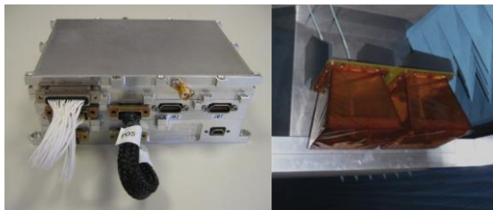
Fig. 2: Electronic Unit (left) and antenna system mounted on a rover mockup (right).

Antenna design and accommodation have significant influence on the instrument performance. Usually, GPR antennas are placed directly on the ground or mounted just a short distance above it, with respect to the wavelength. Due to the design of the Mars rover, the GPR antenna system will have to deal with a ground clearance of 30 to 60 cm, which is equal to 3 to 6 wavelengths at WISDOM's highest operating frequency. This distance to ground will lead to an increased field of view, lower gain inside the dielectric medium, free space loss and significant radiation coupling effects between parts of the rover and the