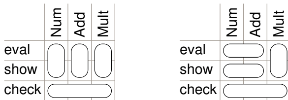
(a) Data oriented initial decomposition. (b) Operation oriented initial decomposition.

There are many ways to extend the data-type or the set of operations indifferently in a modular way (see [4] for a review of some solutions). However, after the modular addition of an operation, the code is not modular anymore with respect to subtypes (see Fig 4), and after the modular addition of a subtype, the code is not modular anymore with respect to operations. For this reason, (language-based) solutions for modular extension conflict with modular maintenance.