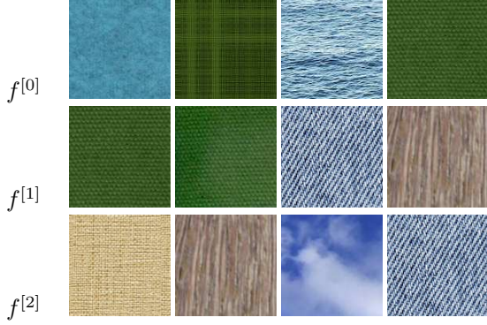
Fig. 1. f^{[0]} , f^{[1]} , f^{[2]} original textures, see text.

Proof. The proof follows the one in [12] with the extra care that the covariance can be rank-deficient, hence requiring a pseudo-inverse. \square