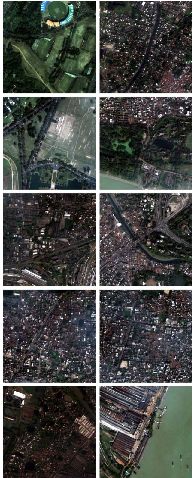
Figure 3. Set of the ten images used for testing the proposed protocol.

where a and b are values to be adjusted experimentally, so that a+b=1 and 0 < QI_{glob} < 1 . Clearly, the higher the QI_{glob} , the better is the quality, and the lower the QI_{glob} , the worse is the quality.