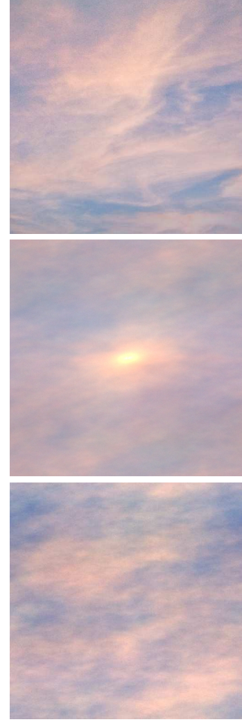
Fig. 3. Top: the original color image (it is the periodic component ([6]) of an image of a sunset). Middle: the color texton of this image obtained by subtracting the phase of the luminance to the three channels. Bottom: a sample of the phase randomization procedure (the same random phase is added to the three channels in order to preserve the phase differences, see Proposition 2).