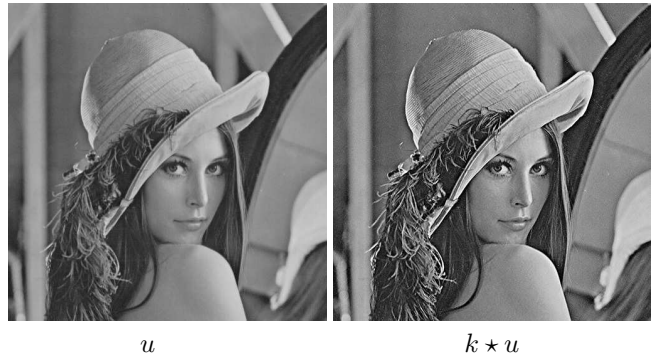
Fig. 2. Blind deconvolution of Lena image. Selecting the separable symmetric 21 \times 21 kernel k that maximizes the Sharpness Index of k \star u ( u being the original Lena image, bottom left) results in a sharper image (bottom right) that reveal some details of the original image, while keeping noise and ringing at an acceptable level.

perspectives, both from a theoretical viewpoint (the explicit formulas will probably ease further analyses) and as concerns applications (in particular image restoration), for which computation time and estimation errors are no more a limitation.