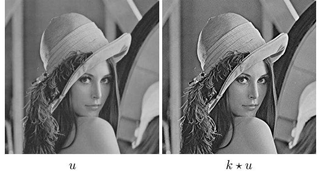
Fig. 2. Blind deconvolution of Lena image. Selecting the separable symmetric 21 \times 21 kernel k that maximizes the Sharpness Index of k \star u ( u being the original Lena image, bottom left) results in a sharper image (bottom right) that reveal some details of the original image, while keeping noise and ringing at an acceptable level.

perspectives, both from a theoretical viewpoint (the explicit formulas will probably ease further analyses) and as concerns applications (in particular image restoration), for which computation time and estimation errors are no more a limitation.