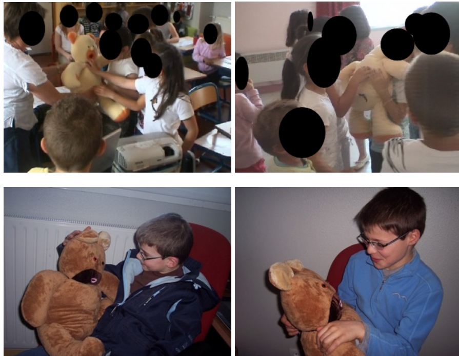
Fig. 2. Evaluation of second and third version of Emi with children