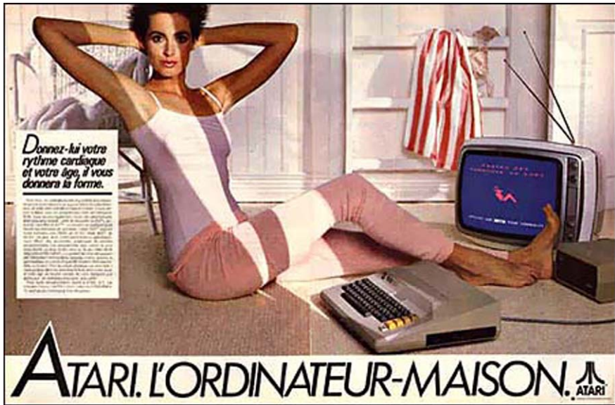
Figure 3. Personal computer enables physical performance (Anon., 1983b)

placed in front of her. The copy reads: 'Enter your heart rate and your age, and it will put you back into shape.'