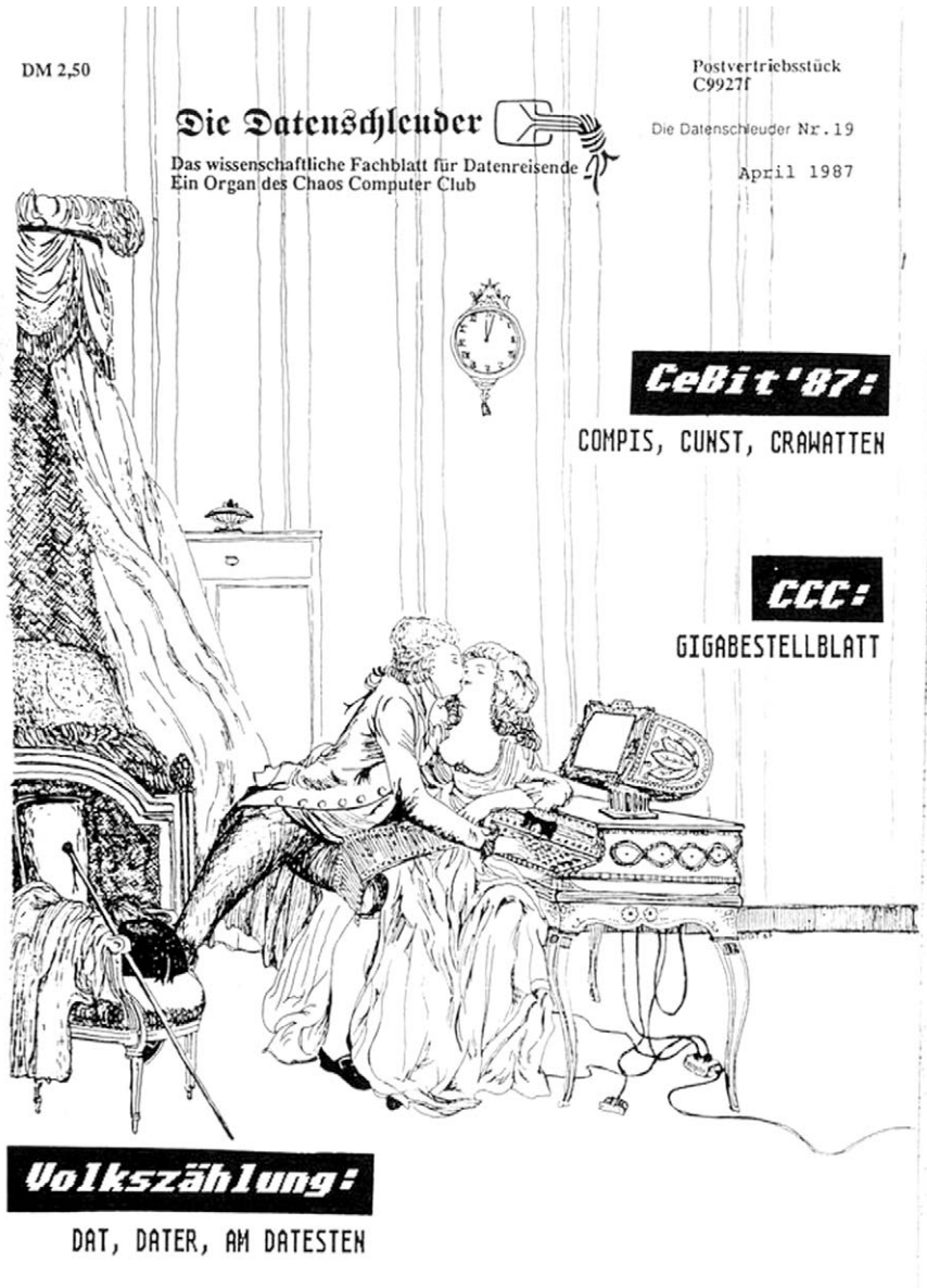
Figure 5. Sexualizing the computer: parody of computer 'intimacy' in a 1980s hacker fanzine (Anon., 1987)

anatomy and the virus are presented as sharing the same nature (they are both 'bugs', which is what seems to be suggested by the brain's cockroach legs). Even so, they remain two distinct objects, and do not permeate each other.