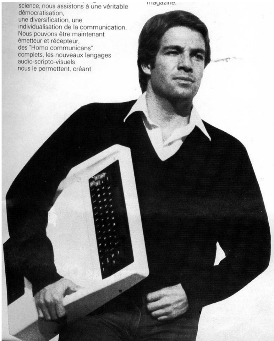
Figure 4. The computer 'sticks to the body' (Anon., 1982)

no longer external to their users, but next to them: 'Eighties tech sticks to the skin' (Sterling, 1986: 12) and sometimes it even goes so far as to penetrate under the skin and into the body. The 1986 'Hacker Manifesto' (The Mentor, 1986) effectively completes the metaphor by comparing computer hacking to intravenous drug use. 15 References to HIV/AIDS and risk-taking behaviours are not alien to the computer iconography of these years, but, in comparison with the written resources examined in the previous section ('Computer Viruses: