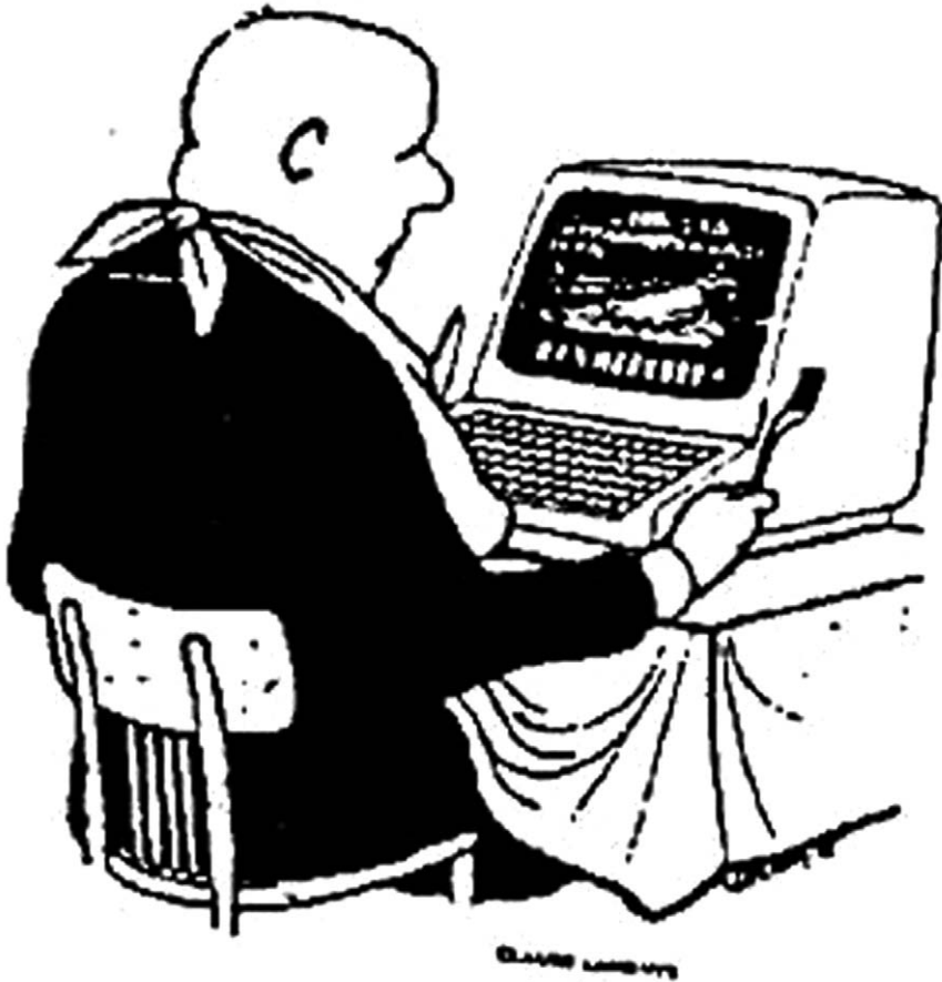
Figure 6. Hunger for information: incorporating the computer through ingestion (Anon., 1988)

For permeation to occur, the dense and solid qualities of the organs need to be liquefied. Playing on a macabre repertoire, German hackers start exposing physical decadence and necrosis. On the same synchronic axis used to analyse the mainstream press sources in the previous section ('Computer Viruses: Inscribing Computer Culture in the Biomedical Domain'), the motifs of computer virality and viscosity become detectable after 1988. The user's body comes to be represented as a corpse 'secreting' information as a blister would secrete pus. On the cover of issue no. 30 (Figure 8), an animated skull mocks the German postal authorities warning: 'This communication might have been opened for inspection'. To add morbidity to the image, from the zipper-lined open wound on the top of the skull, a slimy substance spurts out.