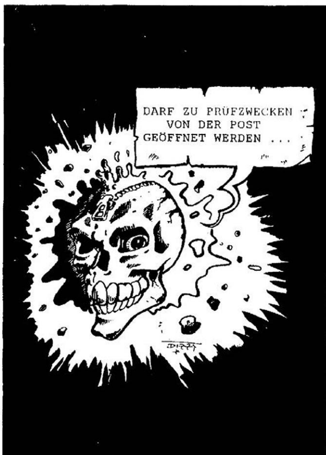
Figure 8. Informational virus as liquid infection (Dizzy, 1989)

issues, and technological artefacts to the body. Explaining that requires a better understanding of the strong discursive link between computer virulence and the AIDS moral panic, which can be achieved by taking into account the social and cultural circumstances surrounding computer culture in the 1980s. The HIV/AIDS pandemic was actually the sign of a deeper crisis in the controlling and protective function that the biomedical establishment (clinical professionals,