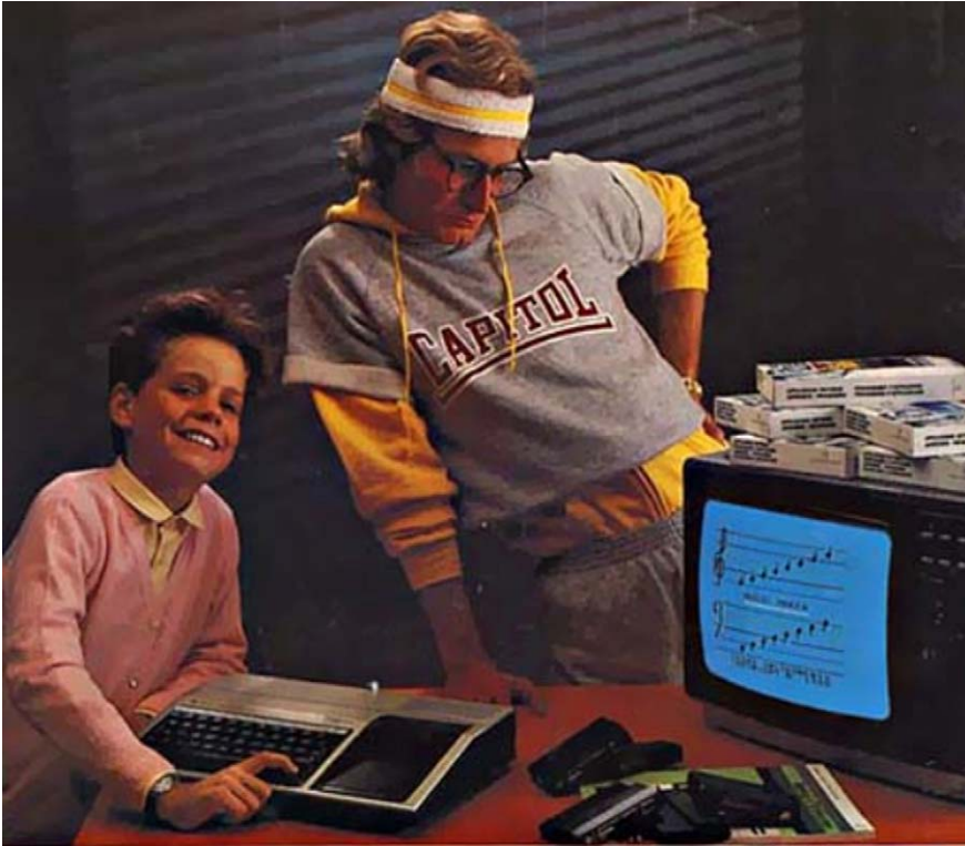
Figure 2. Family computer and physical exercise (Anon., 1983a)

Home privacy became synonymous with personal, bodily intimacy. In the media, there was an increasing trend to emphasize the association between autonomous computing and bodily performance, beauty and health. The well-known Apple 1984 TV commercial (Scott, 1984), 14 for example, staged the liberating power of personal computers by opposing a young female athlete to a crowd of senile users living under the rule of an Orwellian Big Brother.