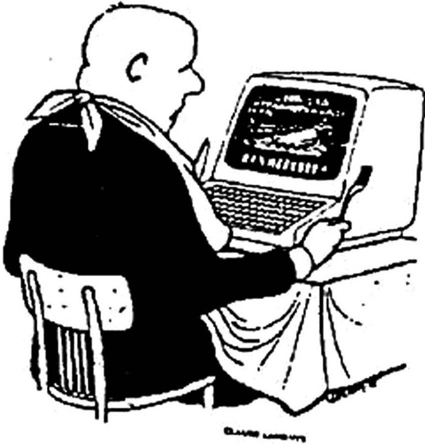
Figure 6. Hunger for information: incorporating the computer through ingestion (Anon., 1988)

For permeation to occur, the dense and solid qualities of the organs need to be liquefied. Playing on a macabre repertoire, German hackers start exposing physical decadence and necrosis. On the same synchronic axis used to analyse the mainstream press sources in the previous section ('Computer Viruses: Inscribing Computer Culture in the Biomedical Domain'), the motifs of computer virality and viscosity become detectable after 1988. The user's body comes to be represented as a corpse 'secreting' information as a blister would secrete pus. On the cover of issue no. 30 (Figure 8), an animated skull mocks the German postal authorities warning: 'This communication might have been opened for inspection'. To add morbidity to the image, from the zipper-lined open wound on the top of the skull, a slimy substance spurts out.