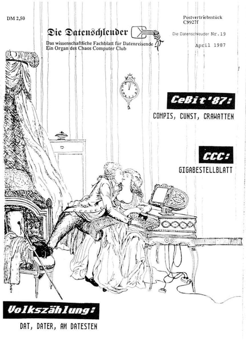
Figure 5. Sexualizing the computer: parody of computer 'intimacy' in a 1980s hacker fanzine (Anon., 1987)

anatomy and the virus are presented as sharing the same nature (they are both 'bugs', which is what seems to be suggested by the brain's cockroach legs). Even so, they remain two distinct objects, and do not permeate each other.