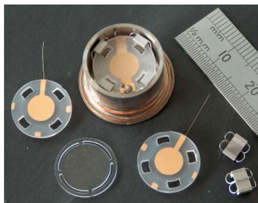
FIG. 1. (Color online) A home-made BVA-type resonator. The planoconvex resonator is pinched between two disks that support both electrodes. Vibration energy is trapped thanks to the resonator curvature radius.

A network analyzer linked to a frequency reference (H-Maser) and equipped with its impedance test adapter is used to get directly the complex admittance of the tested resonator. This simple method has been preferred to the conven-