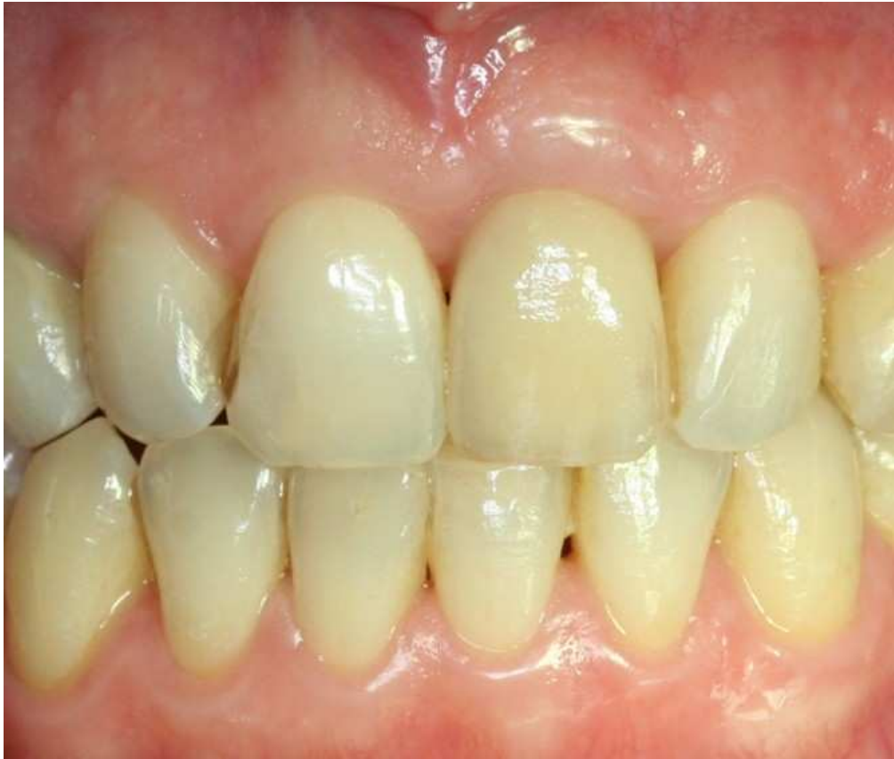
234x200mm (72 x 72 DPI)

1 2 3 4 5 6 7 8 9 10 11 12 13 14 15 16 17 18 19 20 21 22 23 24 25 26 27 28 29 30 31 32 33 34 35 36 37 38 39 40 41 42 43 44 45 46 47 48 49 50 51 52 53 54 55 56 57 58 59 60