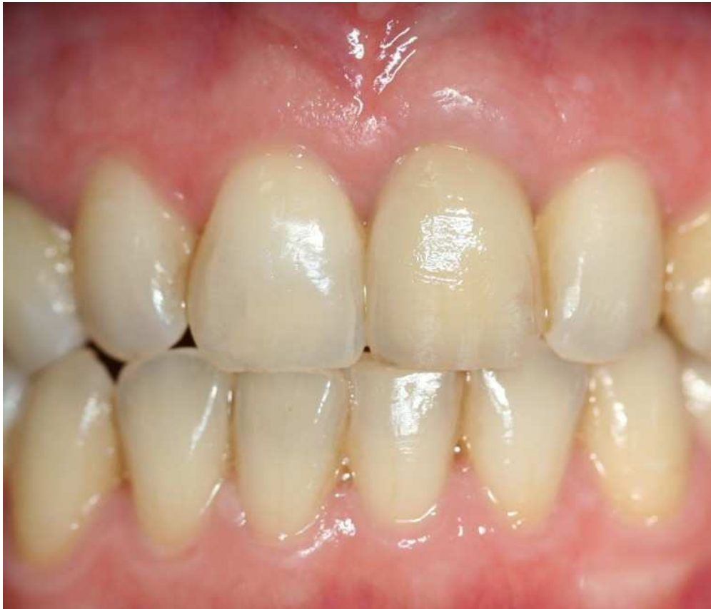
271x231mm (72 x 72 DPI)

1 2 3 4 5 6 7 8 9 10 11 12 13 14 15 16 17 18 19 20 21 22 23 24 25 26 27 28 29 30 31 32 33 34 35 36 37 38 39 40 41 42 43 44 45 46 47 48 49 50 51 52 53 54 55 56 57 58 59 60