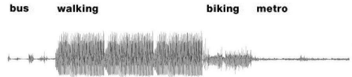
Fig. 2. Accelerometer traces for distinct transportation modes (from http://senseable.mit.edu/co2go/ )

Another interesting thing is that it is possible to determine the means of transport if the user is provided with an accelerometer and an electronic compass (see [11] and Fig. 2).