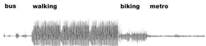
Fig. 2. Accelerometer traces for distinct transportation modes (from http://senseable.mit.edu/co2go/ )

Another interesting thing is that it is possible to determine the means of transport if the user is provided with an accelerometer and an electronic compass (see [11] and Fig. 2).