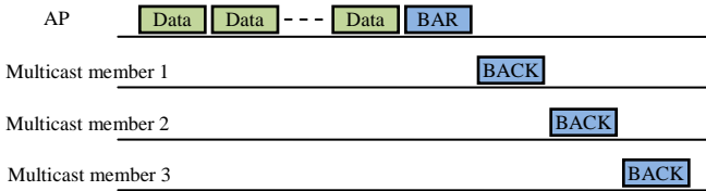
Figure 1. Typical frame exchange scenario with MRG-Block-Ack policy

Since MRG service is defined for multicast transmissions, the MRG BAR is slightly changed compared to that of the unicast in order to add the following information: the multicast members and the acknowledgement order. When a BAR is used as part of MRG-Block-Ack, a new field with a variable length called “MRG BAR information field” is added to the BAR. This field allows the AP to ask for a feedback from up to 2008 associated STAs. Thus, the field’s length may reach 253 bytes. This length may introduce a useless overhead since multicast groups in a WLAN have limited members typically fewer than 8, and becomes annoying when each multicast frame needs to be individually acknowledged.