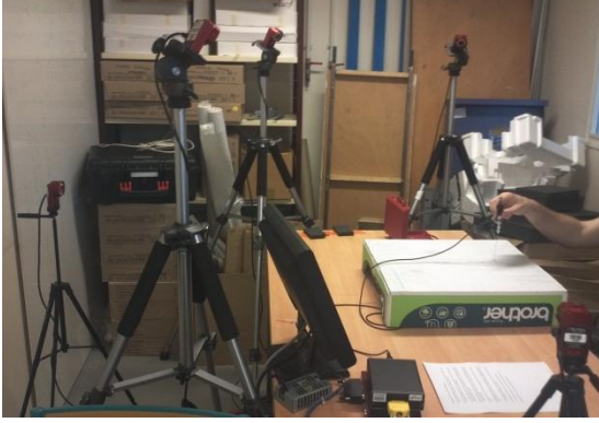
Fig. 4: Experimental setup