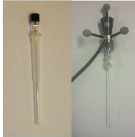
Fig. 3: Anesthetic (left) and instrumented (right) needles for position and force/torque measurement

To comply with the anesthetic needle insertion, a 22° bevel-tip needle was used. An ATI Nano 17 force sensor which has 6 degrees of freedom (3 force and 3 torque) was mounted to the handle of the needle to measure the instantaneous force that was felt by the user during the needle insertion. The force sensor had an ergonomic grasping device for ease of access of the haptic needle.