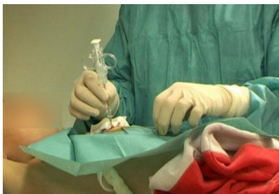
Fig. 1: Needle insertion in a biopsy procedure

In several medical procedures clinicians depend on their haptic perception abilities to insert needles in the patient; for example, in the administration of drugs and in radiological percutaneous needle insertions to perform biopsies as shown in figure 1: