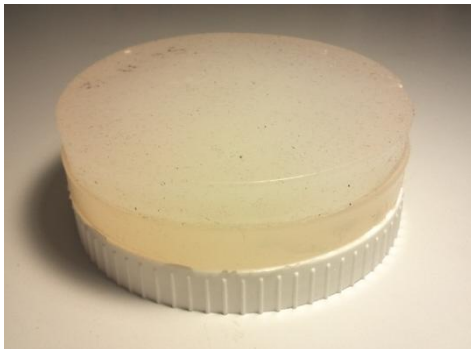
Fig. 2: The dual layer silicon sample

The task was designed to simulate needle handling during anesthetic needle insertion. Tissue was simulated using silicon samples (Figure 2). The participants were instructed to perforate the silicone using an anesthetic needle (Figure 3) until they reached the middle layer of the dual-layered gel samples. Depending on the experimental conditions, the task was performed with or without a visual aid which consisted of a real-time display for the forces applied by the participants on the needle.