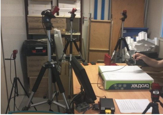
Fig. 4: Experimental setup