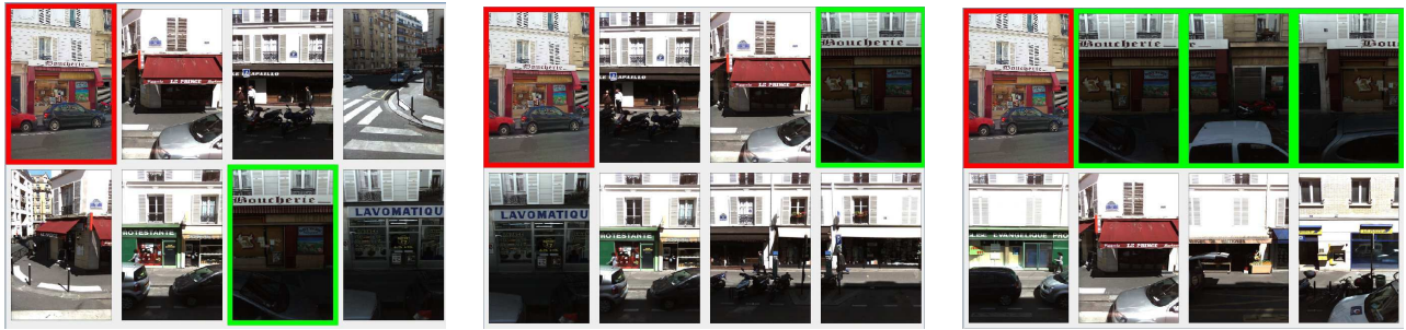
Figure 2: A sample query using the Brute Vote technique (left) and enhanced by geometric consistency by Rotation Histogram (middle) and RANSAC (right). The query image (red border) is followed by the ranked answers (right-left, top-down), some of which are relevant (green border).

little difference between the methods, and only as the number of retrieved images gets very large (over 30), RANSAC starts to show some advantage over the other methods.