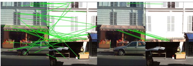
Figure 1: Answering a user query - we want to retrieve the database document (right) corresponding to the user query (left: image taken with a cell phone). The retrieval is performed by matching the local descriptors (green lines). Though many matches may be found (left half) few of them might be correct (right half). Geometric consistency helps to filter out the incorrect matches.

Since our problem involves target identification, we have decided to employ the efficient architecture based on voting over local-descriptors, which was described on the previous section. We have used SIFT [5] to describe the images, due to their robustness. In order to match the descriptors, we have used Multicurves, an indexing based on space-filling curves which is well adapted for very large databases [8].