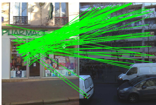
Figure 5: False matches between two images after geometric consistency check with RANSAC.

It is probable that geometric consistency alone will not be enough to achieve high-quality results in contexts like ours, where a large number of non-discriminating descriptors are spanned by problematic image features like tree branches and complex shadows. Those descriptors, which match at random on the database, increase dramatically the number of false matches, inflating the rank of non relevant images (Figure 5). An important addition to the architecture would be the ability to recognize and eliminate those non-informative descriptors.