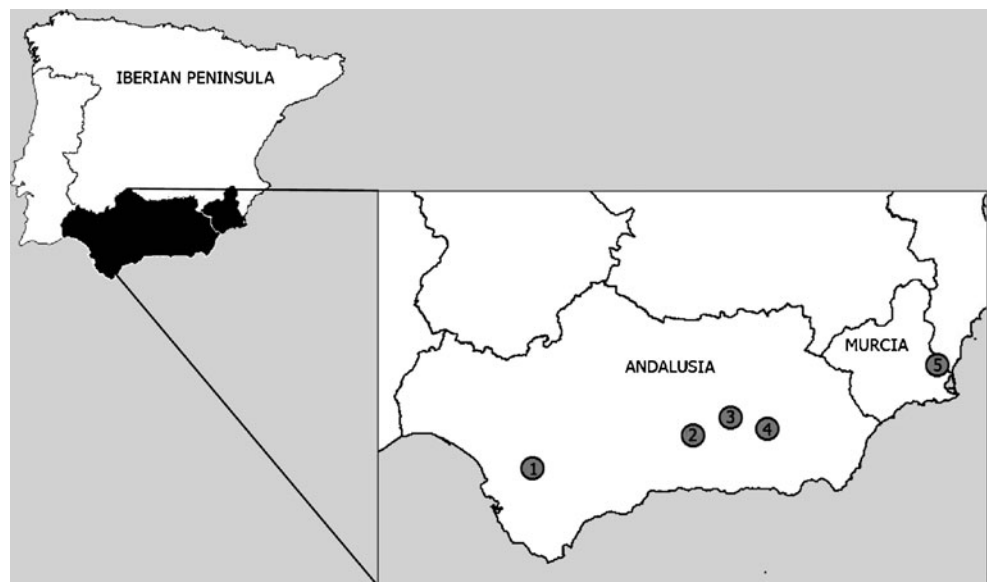
Fig. 1 Location of the settlement areas for Bonelli's eagle considered in this study: 1, Campiña de Cádiz; 2, Valle del Genil; 3, Montes Orientales; 4, Depresión de Guadix; 5, Sierra Escalona. Dietary composition was studied only in settlement areas 2 and 5 (more information in "Methods")

We selected five settlement areas occupied by Bonelli's eagle in southern Spain (from the data of the authors for the 1994–2001 period, Fig. 1), where its population is mostly healthy and well known (Del Moral 2006). In the study area the climate is typically Mediterranean, with the annual temperature averaging 15.6–18.5°C and contrasting mean annual rainfall, from 300 to 790 mm (CMA 1997; Carrete et al. 2002). The landscape of the settlement areas was a mosaic of orchards (including olive or citrus trees) and small patches of natural vegetation (shrubs, grasslands and mixed forest of Quercus ilex and Pinus sp.).