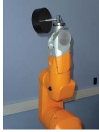
Fig. 2. The 4.59 Kg payload

Its mass has been measured with a weighing machine ( M_L = 4.59 \text{ Kg} \pm 0.05 \text{ Kg} ). The other parameters have been calculated using CAD software. They are given in table 2. Their values are accurate due to the simplicity of the payload shape (Fig. 2).