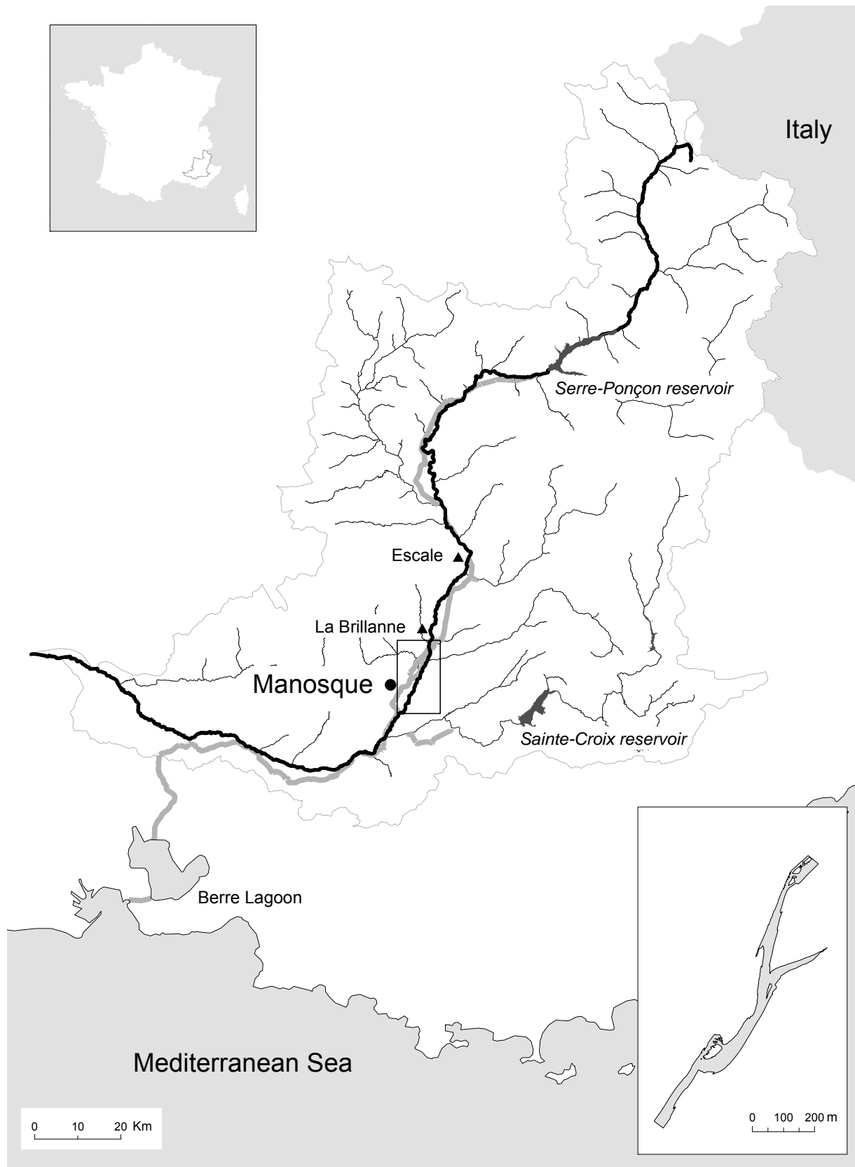
Figure 1: The Durance River basin, its main tributary network (Strahler order \geq 3 ) and the study site located near Manosque (Alpes-de-Haute-Provence). A thick grey line outlines the canal supplying 14 hydropower stations from Serre-Ponçon dam to Berre Lagoon. For clarity, all hydropower stations are omitted from the map. Escale and La Brillanne are gauging stations (see Figure 2). The bottom-right insert shows the studied river reach during the two final years, 2004 and 2005.