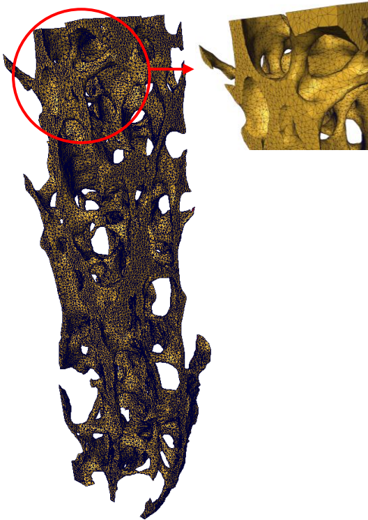
Fig. 1 Three dimensional meshing of a small volume of the trabecular bone, extracted from the cylinder. Dimensions of the volume are 2.2 mm * 2.2 mm * 8.4 mm

After scanning, compressive test was performed at Institut Prisme of Orléans using an Instron 4411 device equipped with a 5 kN load cell, according to the longitudinal direction of the cylinder. Bone cylinder faces were stuck together with resin endcaps. A clip-on extensometer was mounted on the endcaps, as illustrated in figure 2, for which a specific fixture was designed at IPROS for the gripping. A prescribed compressive displacement was applied to the sample at a speed of 0.25 mm/min, at low strains where the material exhibited linear elastic behavior.