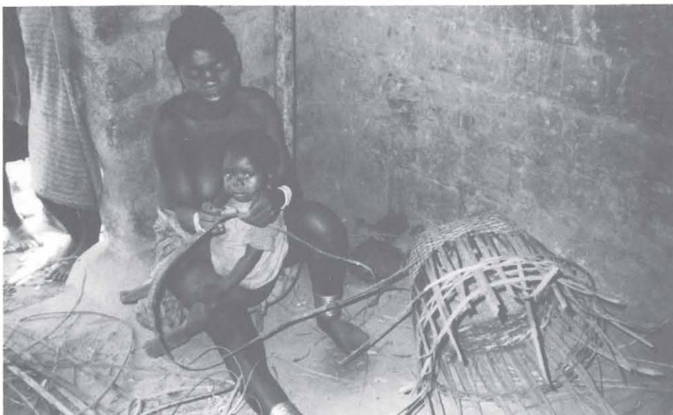
A Ntomba primiparous mother (Twa Pygmy) weaving a basket during her period of seclusion. After several months of total inactivity, the young woman can at last spend her days making the baskets she will need to handle foodstuffs when she rejoins her husband's household and assumes her duties as provisioner of the daily fare.

The Ntomba consist of two distinct populations settled in the same villages, the Oto and the Twa Pygmies (see chapter 2, page 37). They speak the same language and respect the same traditions. With reference to practices surrounding primiparity, a slow evolution can be observed among the Oto whereas the Twa behave as keepers of the tradition.