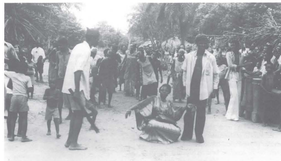
A modern version (inio) of the dance ending the period of seclusion of a primiparous mother, in a Ntomba village of Zaire. She wears a fashionable embroidered long dress instead of the traditional short red one, imported necklaces and bracelets instead of the traditional ones made of brass and cowries, worn with the red ngola wood powder ointment. Seclusion is still considered an important event, even among families following modern life-styles.