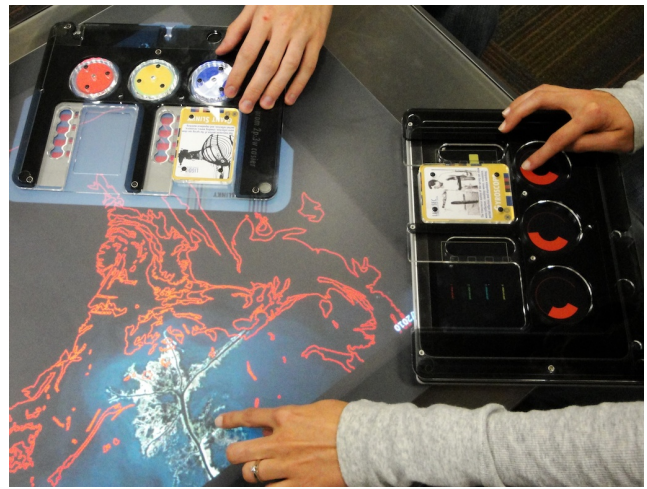
Figure 6. Example of two FH7 (letter page) three-wheeled parameter casiers used on a Microsoft Surface.

alization, complementing Surface-based spatial interactions.