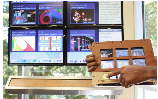
Figure 8. iPad-backed casier in use with a tiled display: Six upper casier regions (illuminated and sensed by the integrated iPad tablet) are used to select presentation options upon the tiled display. A line of six lower casier regions allows selection of which screen is displayed (paralleling content on the tiled display’s lower border). The tile display includes an integrated G8a-format (4.3”×33”) casier, upon which cartouches expressing alternate screen content and behaviors can be placed.

From a software perspective, our current casier implementation is ad-hoc. The Surface implementation is written in C# using WPF; the iPad, upon touchOSC (with remote parsing via Python in SimpleOSC); and on the Bamboo, via TUIO 1.1 and Python + pyTUIO. We are in the process of porting all code to a unified API provided by the tuikit middleware [23]. In the case of Surface, no supporting electronics are required – only placement of Surface visual tags to the underside of the casier and cartouches. As described in [24], we envision an ensemble of visual and electromagnetic tags allowing interoperability between different platforms.