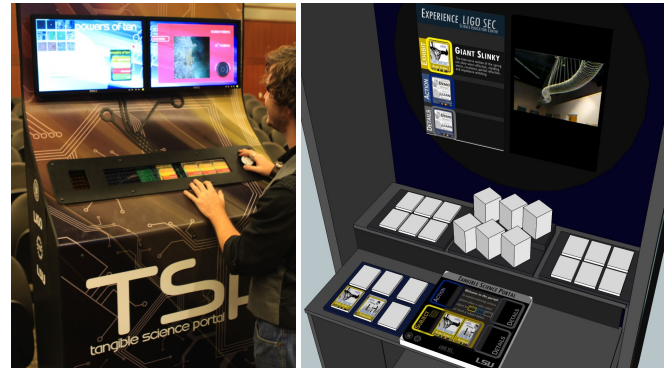
Figure 3. Mid-stage implemented kiosk + envisioned next-gen iteration. In left (implemented) kiosk, a relatively long (32x7”), black casier with captive cartouches and a haptic navigation wheel is visible as manipulated by a student. In the right (envisioned) view, five casiers on two worksurface tiers are depicted. Four are for storage (potentially sensed and illuminated) of thick (here, 3.5x2.5x2.5”) and thin DG6 (card) cartouches. The lower-center casier houses a composition of data, operation, and parameter cartouches on an iPad touch-display surface (see Figure 5 for inset).

the state. State education personnel expressed interest in extending the “hands-on” style of science exposure afforded by the science center exhibits, but in lower cost, computational variations potentially deployable in schools, libraries, and other public venues.