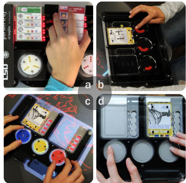
Figure 1. Casier operating across different platforms: (a) standalone tray from [20]; (b,c,d) casier on Apple iPad, Microsoft Surface, Wacom Bamboo Fun – systems marked by diverse sensing, display, and cost. This is prospectively compatible with many other interactive systems.

ital information and operations within and between a variety of interactive systems. Example systems include tangible user interfaces (TUIs), other reality-based interfaces (RBIs) [15], and traditional graphical user interfaces (GUIs) and their more recent variations (e.g., multitouch). Domain tangibles are more specific physical+digital elements, often both in form and function, which are frequently particular to specific application domains, datasets, etc.