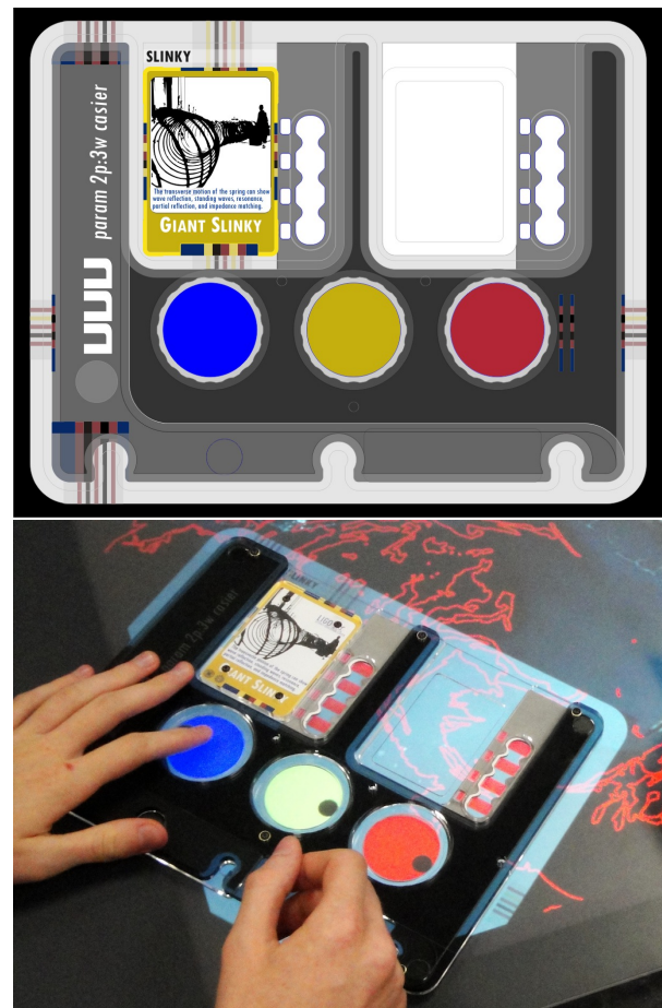
Figure 2. Views of new param casier. This casier currently operates on Microsoft Surface, Apple iPad, and Wacom Bamboo Fun (multitouch+pen), and likely is compatible with numerous other platforms. a) View from design software. A graphical “halo” is visible surrounding all detected tangibles, with cartouche and casier colorbars graphically “extruded” as an indication the correct artifact is detected. b) View as placed upon Microsoft Surface. Three rotary “slotted widgets” are present. In Figure 1c, these are pictured with Surface-tagged wheels inserted. Here, they are pictured with touch interaction bounded by the passive haptic constraints. Two cartouche pads are present, each with four adjoining button/slider slotted widgets. The left pad is occupied by a cartouche. All interactors are placed so as to allow functionality on the sensing surfaces of both the iPad and Bamboo. RFID sensing by supporting electronics is being realized from underneath the Bamboo, and alongside the iPad. The three holes at the bottom of the casier facilitate storage within a traditional three-ring binder.

In introducing core tangibles, several specific form factors for tangible menus (cartouches) and interaction trays (casiers) were described [30], with an assertion that these had implications for tangible interoperability and composition. The introduction of cartouches [24] extended this concept from three specific sizes to an open-ended constellation of physical sizes. This proposition partially mirrored the ISO B-series formats and common imperial-unit approximations (e.g., 2.5×3.5”, 5×3.5”, and 5×7”), but also supporting alternate