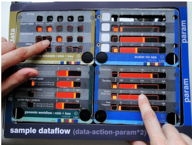
Figure 7. Ensemble of cartouches using slotted widgets on an iPad-backed casier. Four DG7 cartouches describing different aspects of a scientific data flow are present within an FH7 casier on an iPad. Each cartouche – one data, one operation, and two parameter – makes different use of slotted widgets, illuminated and sensed by the iPad. Here, the iPad touchOSC app is the backing software.

nectors to a dual-row rectangular header. (When early tiles were mechanically fixtured, the USB connectors were vulnerable to electrical noise.) The mechanical structure of Figure 3a was built around a Metro-like modular wireframe shelving system, with wooden substructure and a printed adhesive vinyl-coated Sintra (closed-cell PVC foamboard) façade. Graphics on the two VESA-mounted kiosk screens were generated with internally developed PyGame software, hosted by a low-end PC enclosed within the kiosk.