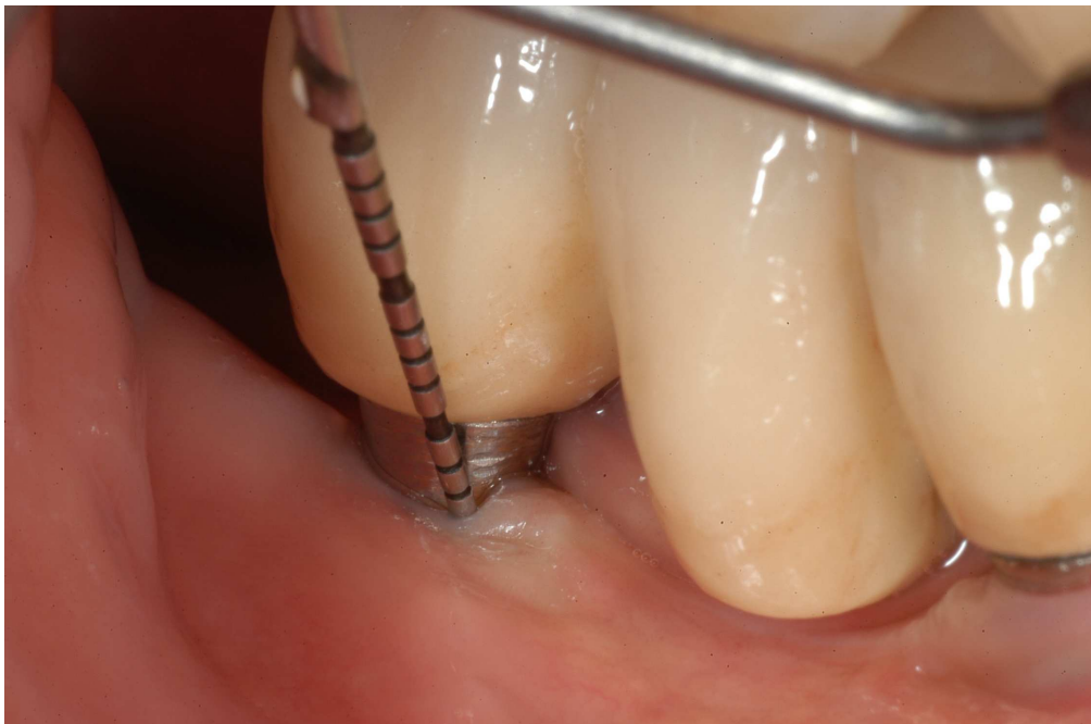
Clinical situation and probing around the implant at 1-year follow-up. 189x125mm (300 x 300 DPI)

1 2 3 4 5 6 7 8 9 10 11 12 13 14 15 16 17 18 19 20 21 22 23 24 25 26 27 28 29 30 31 32 33 34 35 36 37 38 39 40 41 42 43 44 45 46 47 48 49 50 51 52 53 54 55 56 57 58 59 60