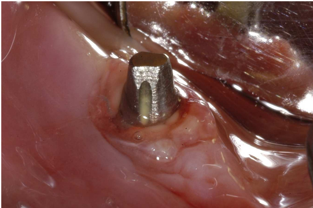
Inflammation and pus around the implant, at baseline. 114x76mm (300 x 300 DPI)

1 2 3 4 5 6 7 8 9 10 11 12 13 14 15 16 17 18 19 20 21 22 23 24 25 26 27 28 29 30 31 32 33 34 35 36 37 38 39 40 41 42 43 44 45 46 47 48 49 50 51 52 53 54 55 56 57 58 59 60