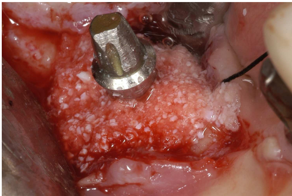
Bovine-derived xenograft applied around the peri-implant defect.

1 2 3 4 5 6 7 8 9 10 11 12 13 14 15 16 17 18 19 20 21 22 23 24 25 26 27 28 29 30 31 32 33 34 35 36 37 38 39 40 41 42 43 44 45 46 47 48 49 50 51 52 53 54 55 56 57 58 59 60