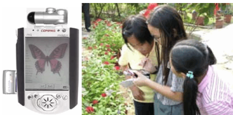
Fig. 1. The Butterfly-Watching System [1]

A possibility with mobile learning is to use the natural environment as a source of information. Some knowledge needs students learning through observation and is not very easy to teach by either traditional classroom teaching or web-based learning environment. Mobile application proves to be useful in this case. For example, the “Butterfly-Watching System” [3] supports an activity in which each learner takes a butterfly picture with a PDA (Fig. 1). Retrieval technique is applied on a database to search for the most closely matching butterfly information and is returned in real time to the learner’s device.