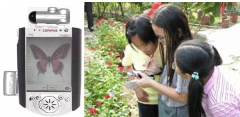
Fig. 1. The Butterfly-Watching System [1]

A possibility with mobile learning is to use the natural environment as a source of information. Some knowledge needs students learning through observation and is not very easy to teach by either traditional classroom teaching or web-based learning environment. Mobile application proves to be useful in this case. For example, the “Butterfly-Watching System” [3] supports an activity in which each learner takes a butterfly picture with a PDA (Fig. 1). Retrieval technique is applied on a database to search for the most closely matching butterfly information and is returned in real time to the learner’s device.