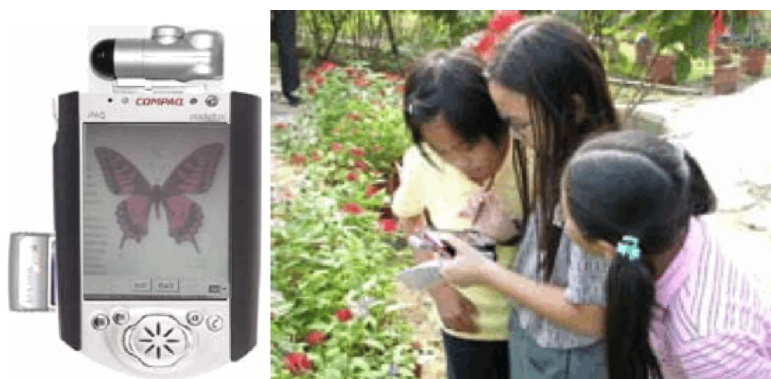
Fig. 1. The Butterfly-Watching System [1]

A possibility with mobile learning is to use the natural environment as a source of information. Some knowledge needs students learning through observation and is not very easy to teach by either traditional classroom teaching or web-based learning environment. Mobile application proves to be useful in this case. For example, the “Butterfly-Watching System” [3] supports an activity in which each learner takes a butterfly picture with a PDA (Fig. 1). Retrieval technique is applied on a database to search for the most closely matching butterfly information and is returned in real time to the learner’s device.