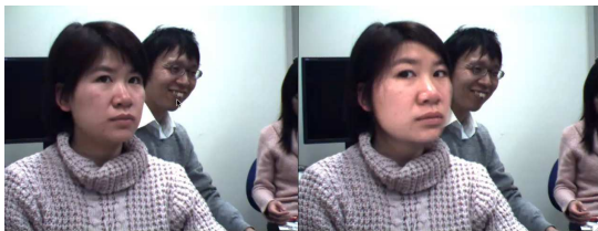
Figure 1: face-swap: B's face is superimposed on A's face

We propose to compare the contingency of movements and familiarity of faces factors in self-recognition in an experiment where an imitator reproduces the head, arms and body movements with or without delay. The imitator's face may be identical to the subject's face or look different. We thus developed a face-swapper for videos that detects the face position and orientation of the current subject A, then superimposes the image of a subject B on A's face (fig. 1 where A and B's faces are identical).