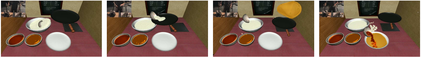
Figure 1: The Virtual Crepe Factory allows users to interact with different viscous fluids to achieve a crepe preparation recipe. The user follows the different steps of the crepe preparation process (stirring and scooping the dough, pouring the dough into the pan, flipping the crepe, spreading the toppings) and feels corresponding force and torque feedback through two haptic devices, one in each hand.

Abstract. The Virtual Crepe Factory illustrates our novel approach for 6DoF haptic interaction with fluids. It showcases a 2-handed interactive haptic scenario: a recipe consisting in using different types of fluid in order to make a special pancake also known as "crepe". The scenario guides the user through all the steps required to prepare a crepe: from the stirring and pouring of the dough to the spreading of different toppings, without forgetting the challenging flipping of the crepe. With the Virtual Crepe Factory, users can experience for the first time 6DoF haptic interactions with fluids of varying viscosity. Our novel approach is based on a Smoothed-Particle Hydrodynamics (SPH) physically-based simulation.