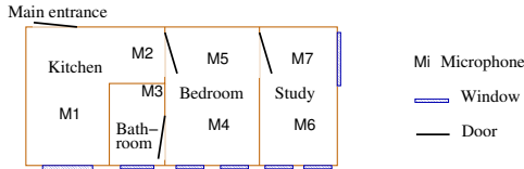
Figure 1: Position of the 7 microphones in the DOMUS Home

HOME speech corpus. 21 persons (including 7 women) participated to a 2-phase experiment to record, among other data, speech corpus in a daily living context. The average age of the participants was 38.5 \pm 13 years (22-63, min-max). To ensure that the audio data acquired would be as close as possible to real daily living sounds, the participants were asked to perform several daily living activities in the smart home. A visit, before the experiment, was organized to make sure that the participants will find all the needed items to perform the activities. No instruction was given to any participant about either how they should speak or in which direction. Consequently, no participant emitted sentences directing their voice to a particular microphone. The distance between the speaker and the closest microphone is about 2 meters. Sound data were recorded in real-time thanks to a dedicated PC embedding an 8-channel input audio card [3].