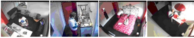
Fig. 2. Images captured by the DOMUS video cameras during the experiment