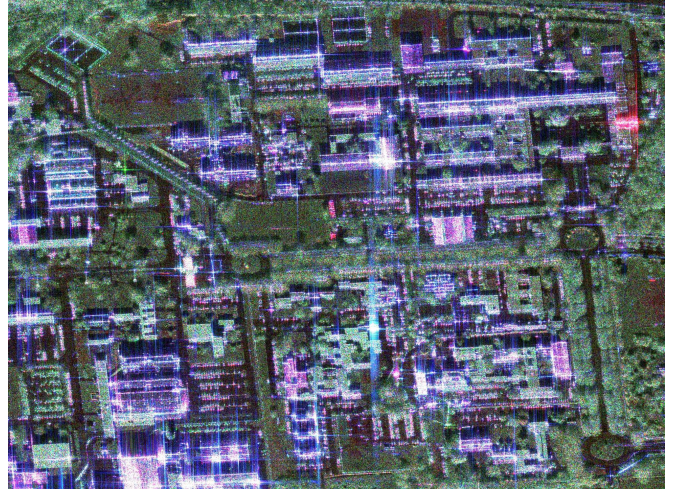
Fig. 1. Toulouse, RAMSES POLSAR data, X-band, 1500 \times 2000 pixels: amplitude color composition of the target vector elements k_1 - k_3 - k_2 .

The high resolution POLSAR data set, illustrated in Fig. 1, was acquired by the ONERA RAMSES system over Toulouse, France with a mean incidence angle of 50^\circ . It represents a fully polarimetric (monostatic mode) X-band acquisition with a spatial resolution of approximately 50 cm in range and azimuth. In the upper part of the image one can observe the CNES buildings.