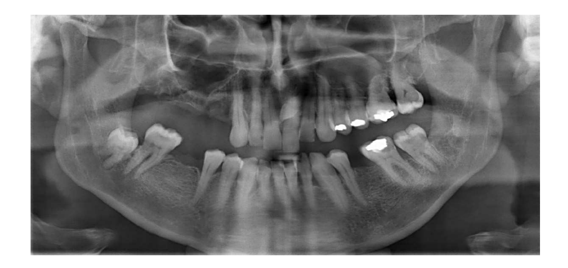
424x200mm (72 x 72 DPI)