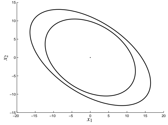
Fig. 1. Ellipsoidal estimations obtained with Theorem 3 (inner) and Proposition 5 (outer).

whose eigenvalues are 1.2209 \pm 0.4444i , and