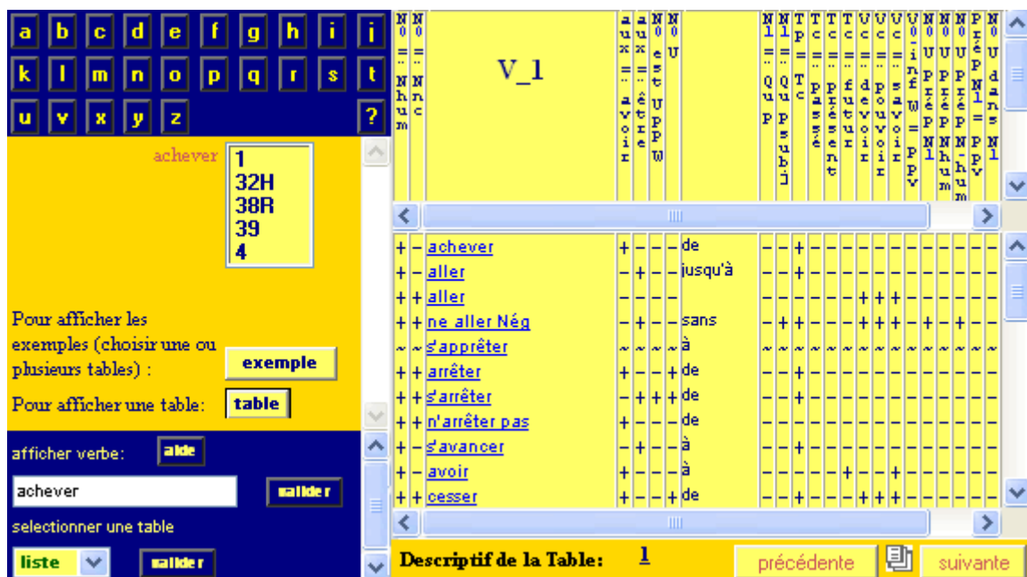
Figure 2: Web interface for the visualisation of LGTs