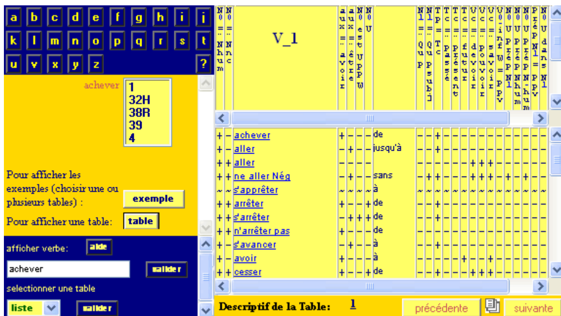
Figure 2: Web interface for the visualisation of LGTs