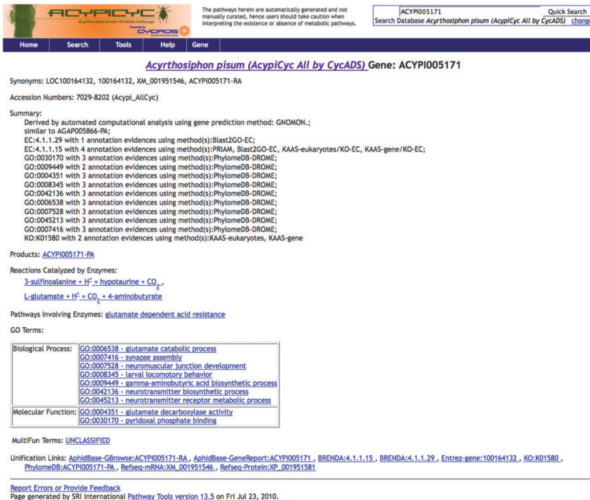
Figure 2. Screenshots of a BioCyc database generated by CycADS. An example page from AcypiCyc showing the enrichment of a BioCyc gene page with complementary information about the annotation source included in the 'Summary' and extra hyperlinks ('Unification Links') to important resources.

shows the relative contributions of the different annotation methods used. This type of comparison could also be used to evaluate the relative contributions of each method to obtain the desired cut-off level for a metabolic network reconstruction. In fact, the different contributions of each method show that a real network comparison needs to take into account the annotation source for a given genome. Indeed, only 428 reactions (435 genes) are annotated by all EC methods, giving a high level of support for these reactions in the network. For many other cases, different methods do not totally agree, so even if there is a partial overlap, the summary contributions can be of