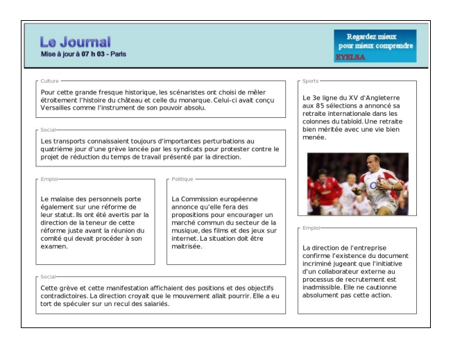
Figure 1: Example of page used in the experiments.

LSA was trained on a 24 million word French corpus composed of all articles published in the newspaper "Le Monde" in 1999. A 300 dimension space was generated from the corpus, by means of a singular value decomposition of the word x paragraph occurrence matrix (see. Martin & Berry (2007) for more details). Each word of the corpus being represented as a 300 dimension vector, new texts can also be represented as vector by means of a simple sum of their words. A cosine function was used to compute