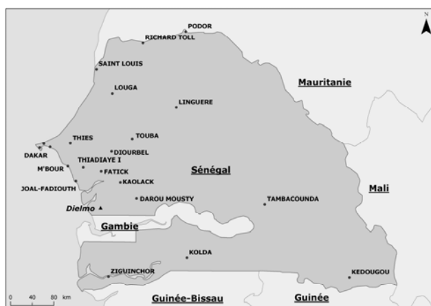
Map 1: Location of Dielmo in Senegal

Dielmo (13°45'N, 16°25'W), a village of about 300 inhabitants, is situated 280 km on the southeast of Dakar in the Sahelo-Soudanian region of Senegal (Map 1).