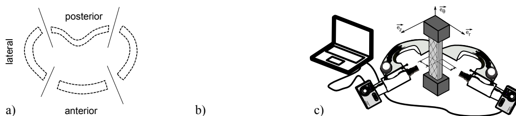
Figure 1: a) Lumbar disc with specimens locations; b) Annulus specimen with aluminium rings; c) Experimental device

Lumbar discs (L3-L4) were harvested from cadaver of a domestic pig and separated from the vertebral bodies by blunt dissection. From each quadrant (Fig. 1a), one plane-parallel ( 2 \times 2 \times 10 mm) specimen was carved out using a specific tool. Both specimen ends were glued into aluminium rings using cyanoacrylate adhesive (Fig. 1b).