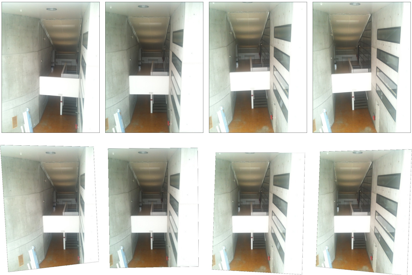
Fig. 5. Multiple image rectification : (Up) four input images. (Down) the four rectified images.