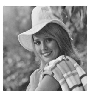
Fig. 4. A grayscale image.

The saliency maps S_1 and S_2 obtained from Fig. 4 thanks to dynamics and surface attributes are depicted in Fig. 5. The saliency S_1 correctly discriminates the significant contours but it also strongly delineates many small highly-contrasted regions which correspond to noise. On the other hand, S_2 does not discriminates these noisy regions, but it divides some large homogeneous zones of the image into several parts. How could we combine the advantages of these two hierarchies? The framework settled in this paper precisely provides an answer: the infimum of S_1 and S_2 ( S_1 \land S_2 ) is depicted in Fig. 5. In the second row of Fig. 5, we also show the segmentations into 100 regions obtained from S_1 , S_2 and S_1 \land S_2 .