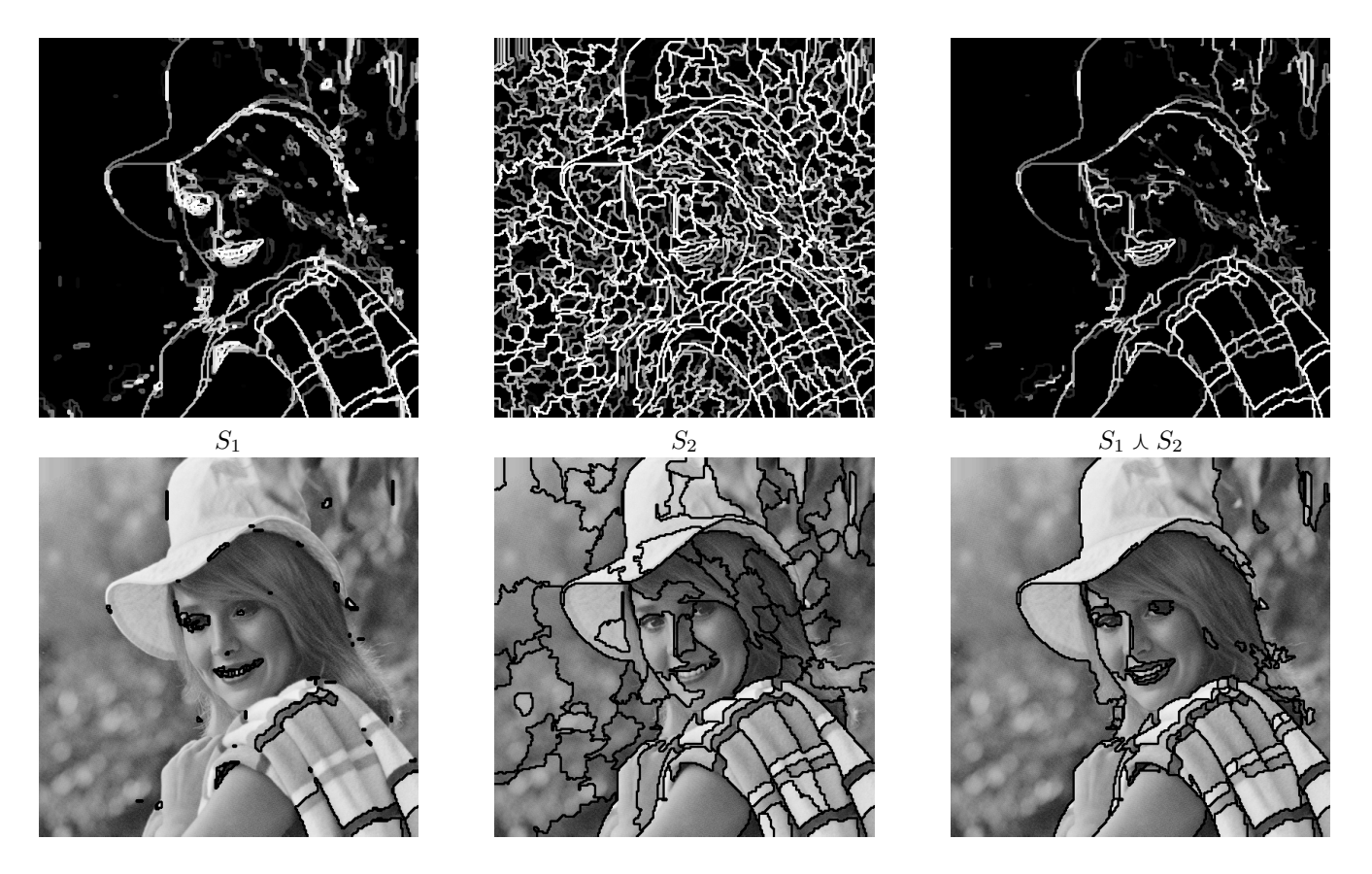
Fig. 5. Saliency maps obtained from Fig. 4 (first row) and associated segmentations into 100 regions (second row) [see text].