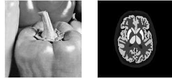
Figure 1: “Peppers” image (left) and “Sebal” image (right).

In our simulations, our objectives are twofold: we will first be interested in studying the influence of the combination of total variation and wavelet regularization terms and then, we will compare the results obtained by using the proposed algorithm with those corresponding to state-of-the-art methods. Two test images ( N_1 = N_2 = 256 ) will be considered (see Fig. 1). For both examples, T is a uniform blur with kernel dimensions Q_1 = Q_2 = 3 . Therefore, the partition cardinality I introduced in Section 3.2 is such that I_1 = I_2 = 4 . C is here defined as (F^*)^{-1} C^* with C^* = [0, 255]^N . A tight frame version of the dual-tree transform (DTT) proposed in [21] ( v = 2 ) using Symlets of length 6 has been employed over 3 resolution levels. Strictly convex non-differentiable potential functions are chosen, such that \phi_k = \omega_k |\cdot|^{p_k} + \chi_k |\cdot| where (\omega_k, \chi_k) \in ]0, +\infty[^2 and p_k \in \{4/3, 3/2, 2\} .