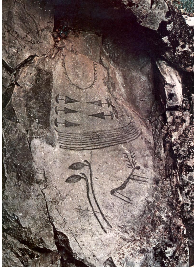
Skeudenn 5: Roc'h Capitello dei Due Pini, Paspardo 51 (Anati, 1982, fig. 228)

only from the end of the Bronze Age did the deer appear on the rocks: “The religion of the deer-god developed therefore during the first millenium B.C. 49 .” Again the relationship between the deer and the sun will prove fundamental although mysterious as shown by a figure carved in Paspardo whereon the symbolized beams of a sun take the shape of antler-tines 50 .