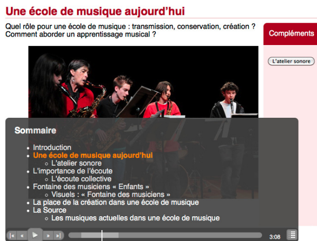
Figure 1: INA Webradio application

The idea is to propose a visually enhanced experience of a radio program, while allowing users to browse the content in a non-linear way, for instance with the table of contents (Sommaire) of Figure 1.