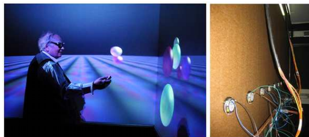
Figure 2: Front (left) and back (right) views of the SMART-I 2 audio-graphical rendering system. The left picture shows a participant using the early approach of interaction.

and a graphical object. See [12] for more informations regarding audio-visual immersive systems using WFS.